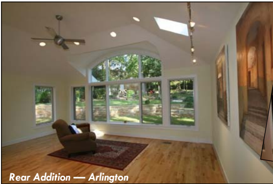
Rear Addition — Arlington