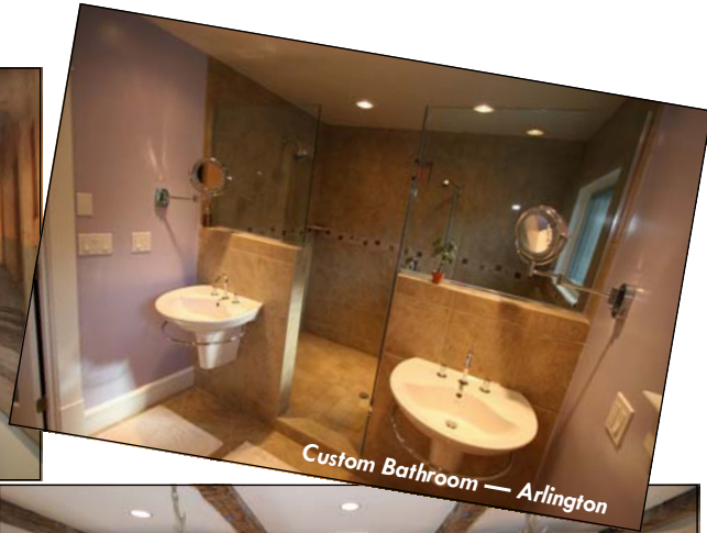
Custom Bathroom — Arlington