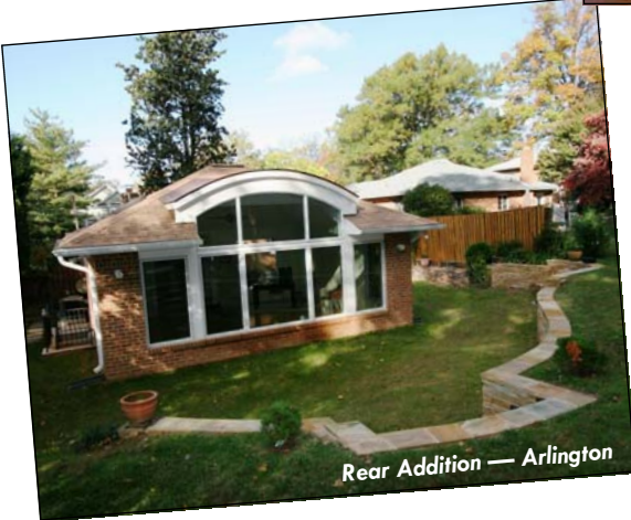
Rear Addition — Arlington